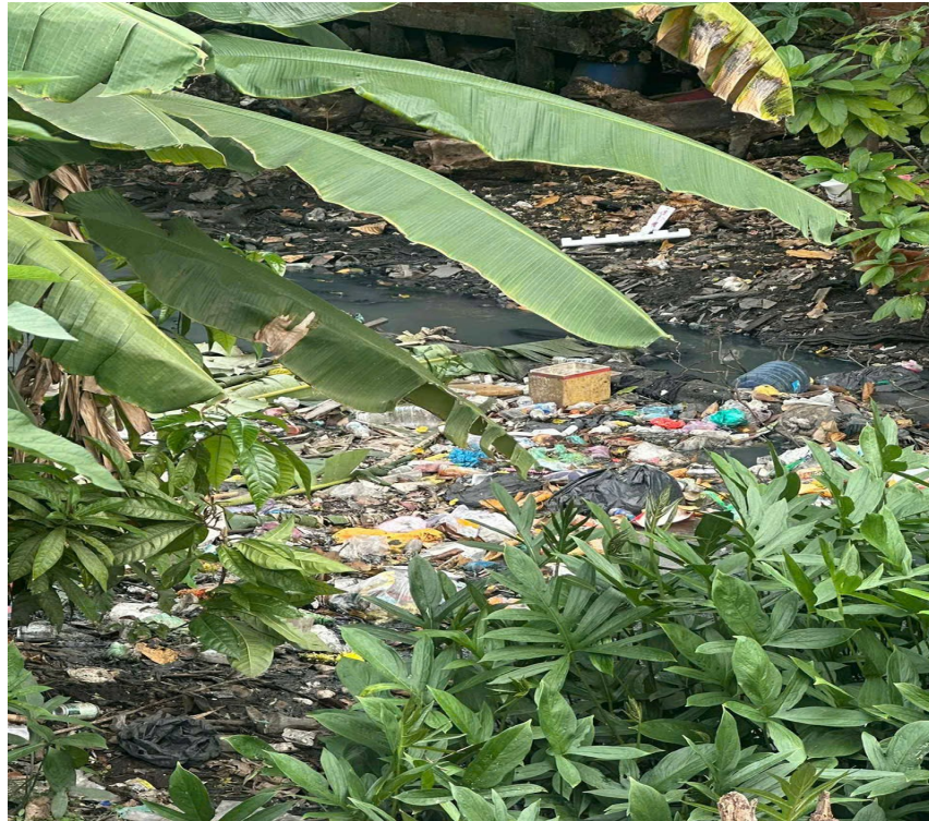
Figure 4. The condition of waste and wastewater directly discharged into Xuyen Tam Canal from factories