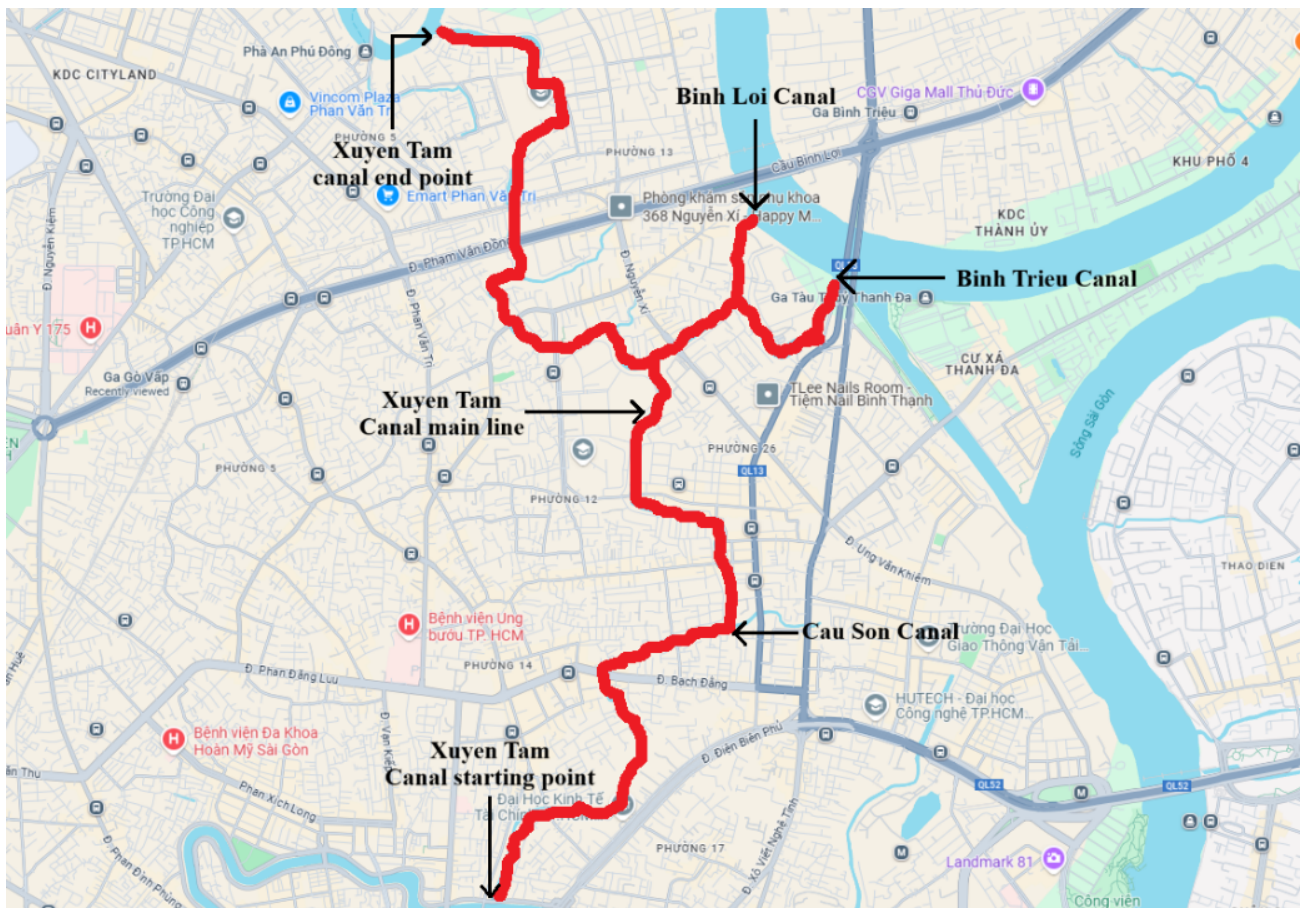
Figure 1. The location of the Xuyen Tam Canal in Ho Chi Minh City

One of the most impacted areas is Xuyen Tam Canal, which flows through the Binh Thanh and Go Vap districts (Figure 1). Once an important waterway for transportation and irrigation, the canal is now severely polluted, and the surrounding areas have become home to thousands of informal settlers. These settlements are characterized by inadequate housing, overcrowding, poor sanitation, and limited access to clean water, creating substantial health risks for the residents. The canal has also suffered from the discharge of untreated wastewater and waste from nearby industries, exacerbating the environmental degradation (Nguyen et al., 2024).