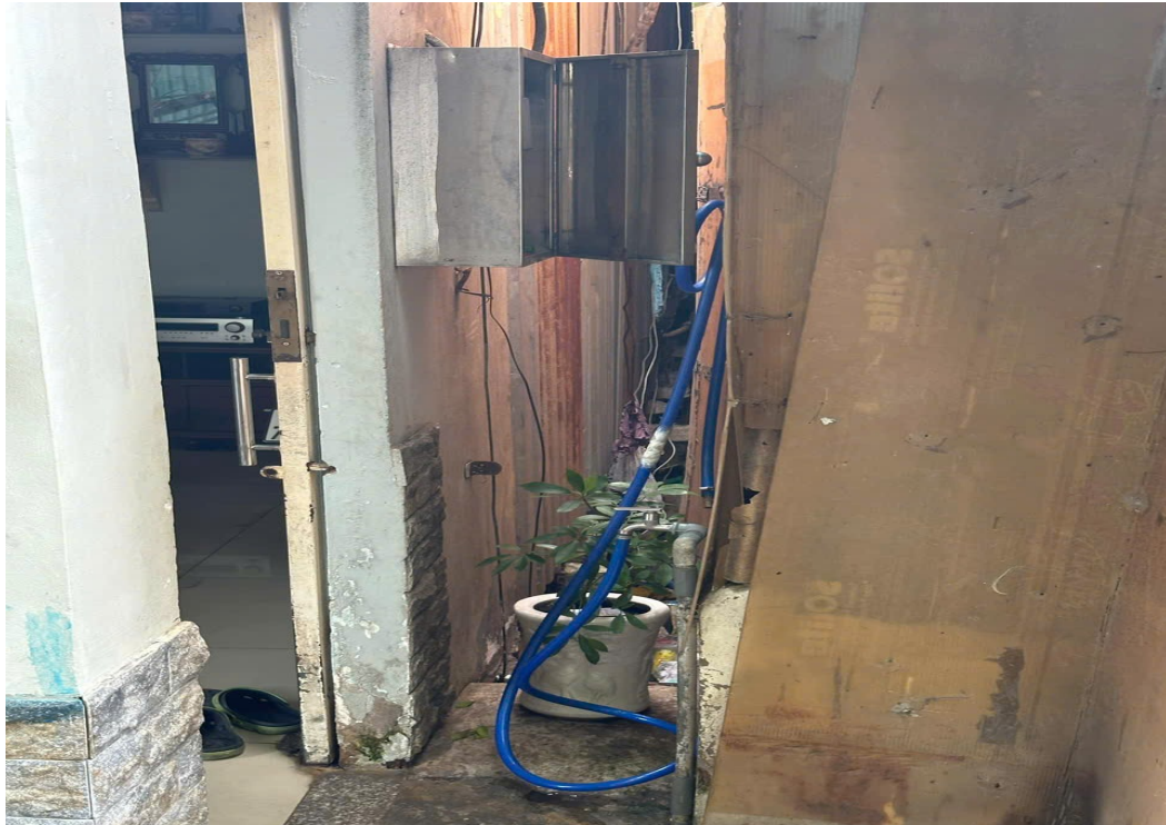
Figure 5. The water supply system for residents living along Xuyen Tam Canal.