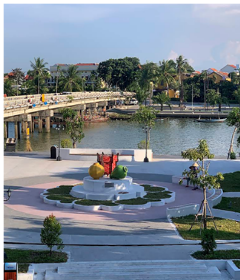
Figure 4. Arrangement of symbolic imagery to create an exhibition space for the area

The design also activates previously underutilized or “negative” spaces across the site: (1) Narrow alleys are optimized by reconfiguring space along their edges—incorporating local cultural slogans, commercial logos, and leftover greenery to install artistic seating. This gives these tight spaces both function and new cultural imagery, redefining their use. (2) The main entrance to the landscape area is framed by symbolic water features and sculptures (e.g., ceramic statues, artistic lanterns), combined with lighting and fog systems where appropriate. This space serves as a central exhibition node, drawing visitor attention and marking the entry experience with cultural expression. (3) Open public squares within the site are reactivated to host diverse events. By reserving flexible gathering areas and designing a series of auxiliary spaces for performances and rest, these squares become versatile venues for commerce, culture, and community events supporting dense public activity and shared experience.