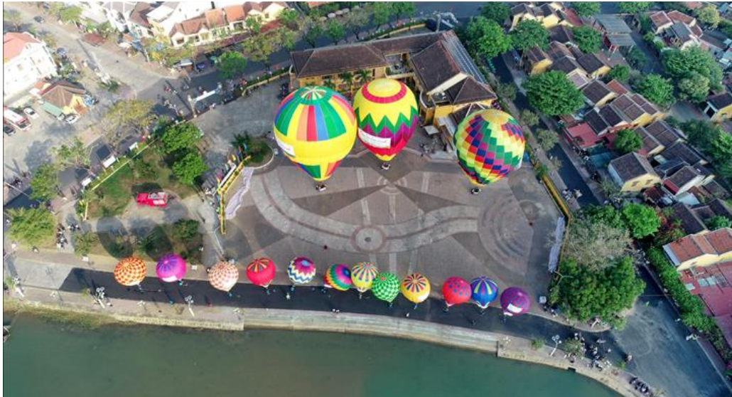
Figure 5. Hoi River Square – An open space designed for public gatherings and community events.

The detailed landscape design emphasizes the use of traditional materials and the integration of cultural symbols. To ensure coherence with the architectural character of the historic district, materials such as reclaimed bricks, laterite stone, and ceramics are used for paving. Iconic local elements like lanterns, brick relief motifs, and Hoi An's familiar ornamental plants are also incorporated to reinforce a culturally consistent and historically grounded style.