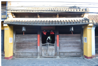
129 Tran Phu Street