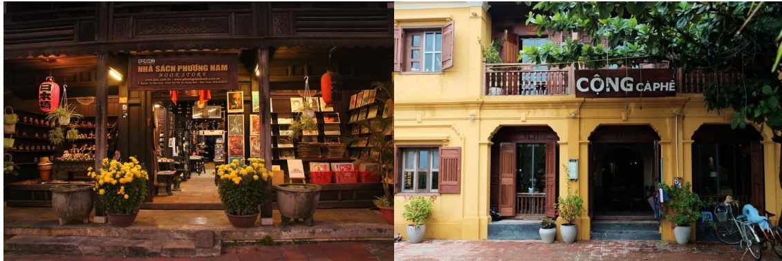
Figure 3. Illustration of the harmonization of form, materials, and color in new constructions within the Hoi An Ancient Town