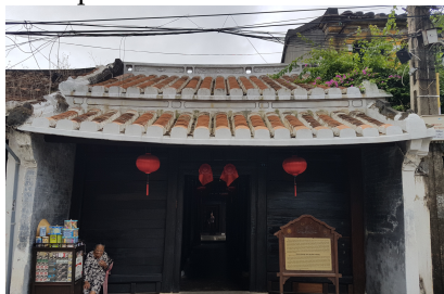
77 Tran Phu Street

In Hoi An, a UNESCO-recognized heritage city, architectural conservation requires strict control over spatial form, building facades, and traditional color schemes (such as turmeric yellow and yin-yang tiled roofs), along with carved wooden elements and traditional construction materials such as ironwood, terracotta bricks, and laterite stones. These elements are not only material assets but also vessels of collective memory. Restoration practices should adhere to the principle of “restoration-in-kind”, meaning the use of traditional techniques and materials to maintain the original characteristics of the structure (Orbasli, 2008).