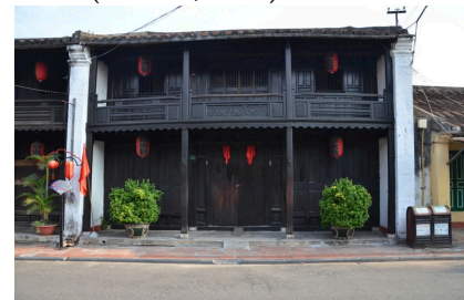
04 Nguyen Thi Minh Khai Street