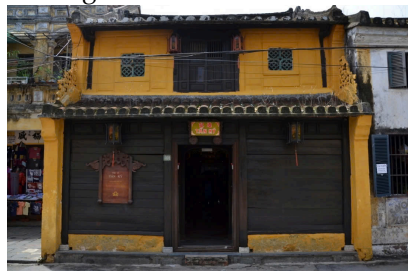
101 Nguyen Thai Hoc Street