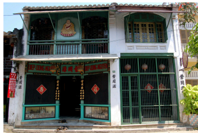
80 Nguyen Thai Hoc Street