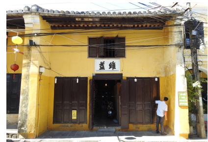
21 Nguyen Thai Hoc Street